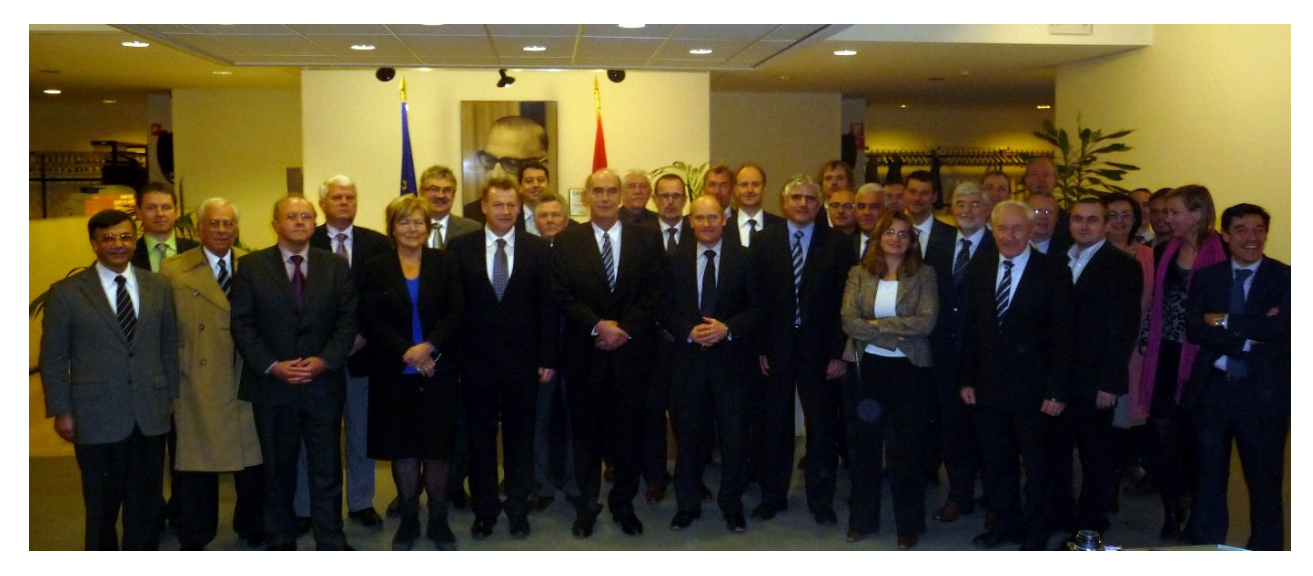
Group picture taken at the conclusion of the ENCASIA election

This election marked the formal beginning of ENCASIA, which was created by Article 7 of Regulation (EU) No 996/2010 with the aim to further improve aviation safety.